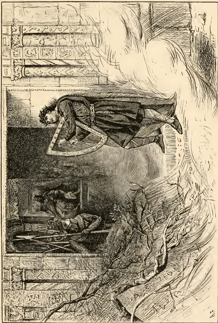
Elphin Singing before Taliesin.